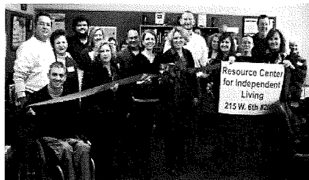
RCIL staff with the Emporia Chamber of Commerce and local businesses at the Emporia Ribbon Cutting Ceremony at the Emporia RCIL Office.

RCIL had two Ribbon Cutting Ceremonies, at the Emporia office on February 11, 2013 and the Iola office on May 9, 2013. These events were hosted by their local Area Chamber of Commerce. Each ceremony had about twenty-five people attend to tour the office and learn more about RCIL programs and services. The Emporia RCIL Office is located at 215 West 6th Avenue, Suite 208. The office is in the Emporia Humanitarian Center with Flinthills Technology College and other non-profit agencies such as Kansas Children's Service League and Kindermusik. The Iola RCIL Office is located at 335 North Cottonwood, Suite C.